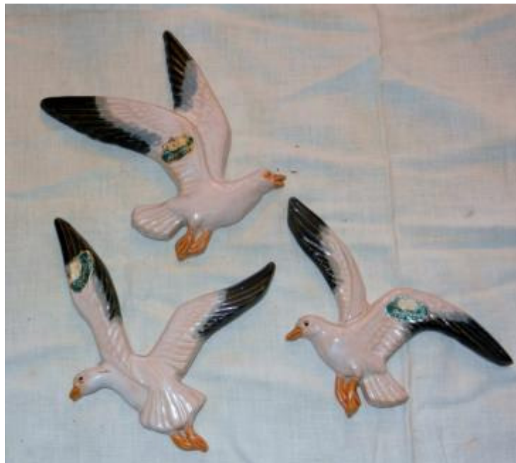
#865 (upper wing on the furthest right seagull has been broken, the break is visible in the photo, and no, I didn't do it, whew!)