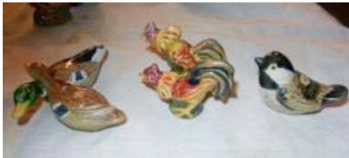
##471, 478, 455