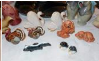
#592, 597, 602, 599