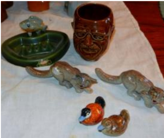
#318, 320, 331, 337