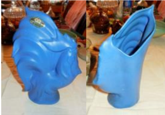
#863 (front and back)