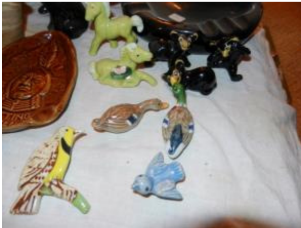
#142, 143, 144, 147, 149