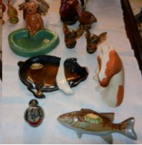
#636, 638, 639, 640, 655, 659