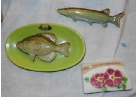
#515, 522, 536