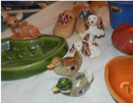
#205, 213, 219