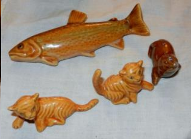
#491, 496, 482