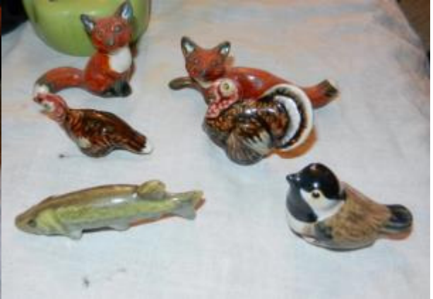
#435, 442, 446, 448