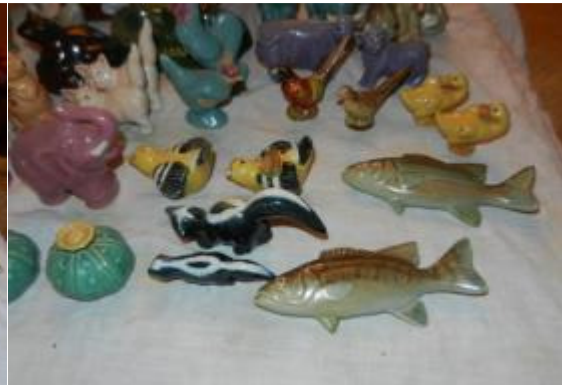
#180, 181, 182