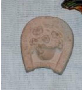
#750 (both sides)