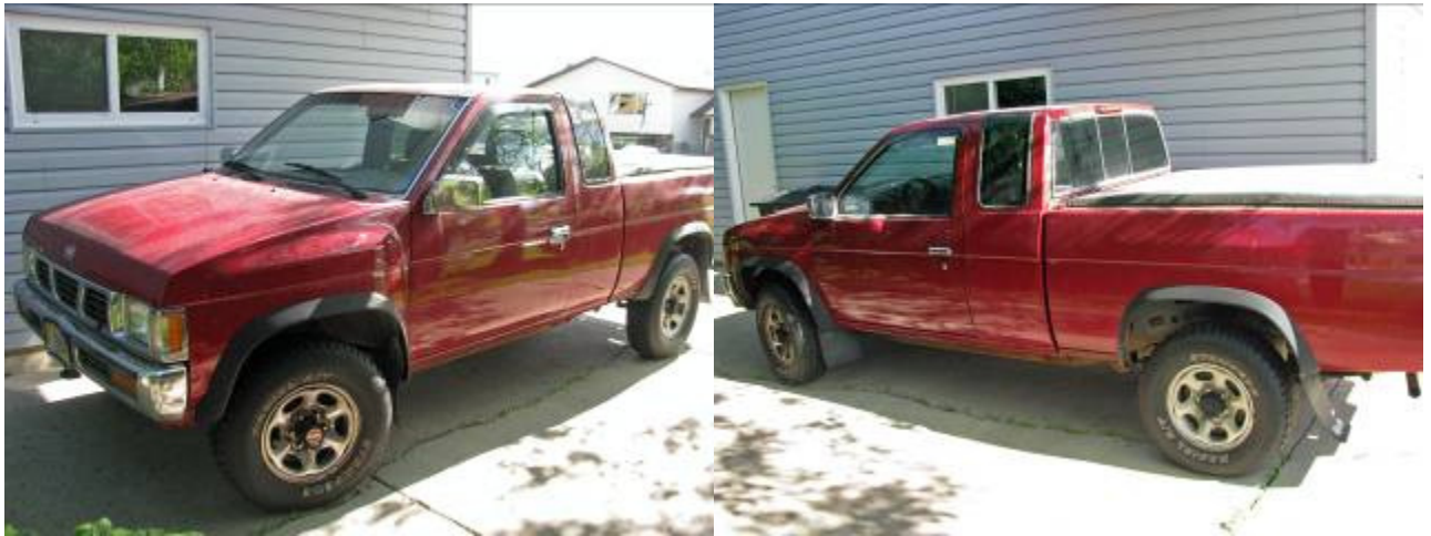
1995 Nissan XE-V6 Pickup, 108,900 miles, 5 Sp, 4 WD, Box Cover, Good Shape