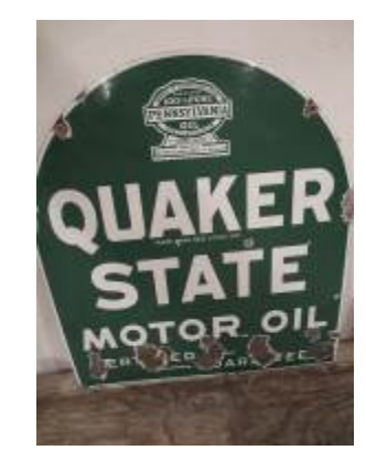
"Quaker State" DS Tombstone